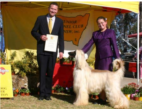
before bathing in Animal House

I have 3 Afghans in full coat each a different coat type and colour 1 Silver, 1 Black & Tan and 1 Butterscotch Brindle. I bath the three of them in Pure Alternative using the recommended dilution of 5:1 and find it to be an excellent product. Not only does the silver in the three coats sparkle but the coats gleam with healthiness. After bathing the dogs I add Purely Silk conditioner which I leave in, the coats are soft & flowing without the feeling of heaviness I have had with other products.