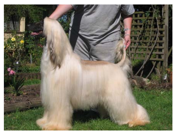
After bathing in Animal House

All in all I am thrilled with the results these products have given and look forward to receiving my order of the Leave in Lustre of which I am sure I will be equally impressed.